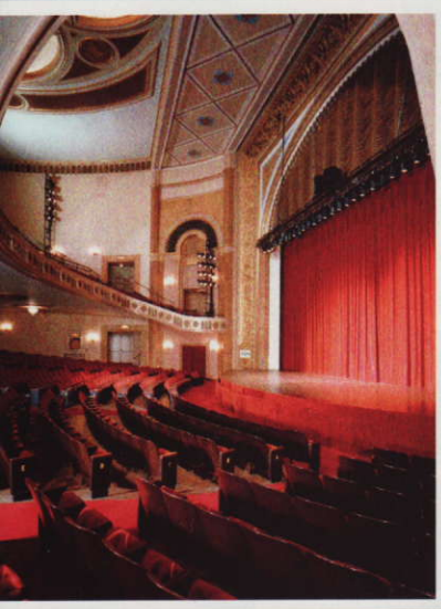
The iconic art-deco Avon Theatre gained new life as a not-for-profit art house. Inset top: 84 park is a welcome addition to downtown nightlife. Inset bottom: The Palace Theatre is a cultural hub for Stamford.