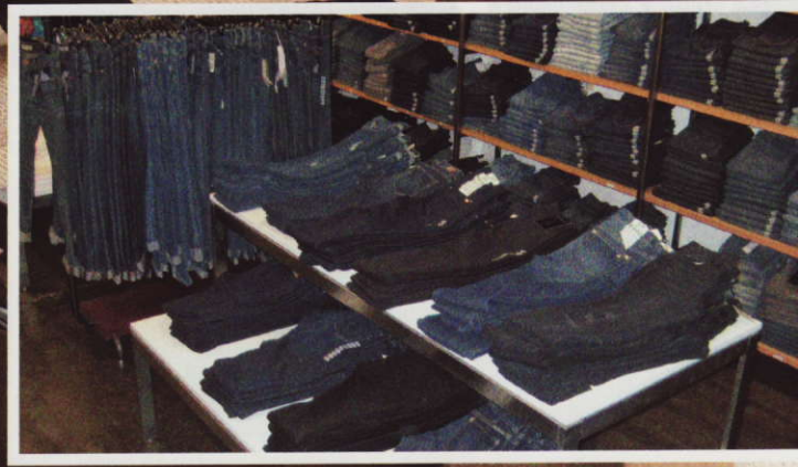
Lord & Taylor has long been known for its shoe oasis. Inset: Havana Jeans is the go-to spot for all things denim.