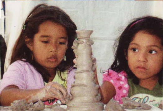
Top: Kids U offers a world of indoor fun. Below: Lakeside Pottery can bring out the sculptor in every child.

FROM OUTINGS IN its dense forests to excursions on a schooner along its coast, Stamford offers a vast array of fun and educational activities for kids and families.